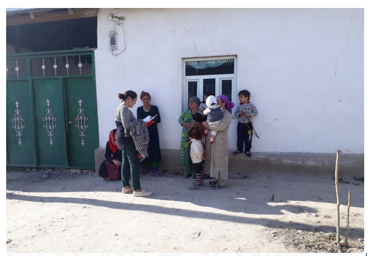
Consultation with residents of Zarbdor jamoat of Kulob area, Khatlon region, March 13, 2019